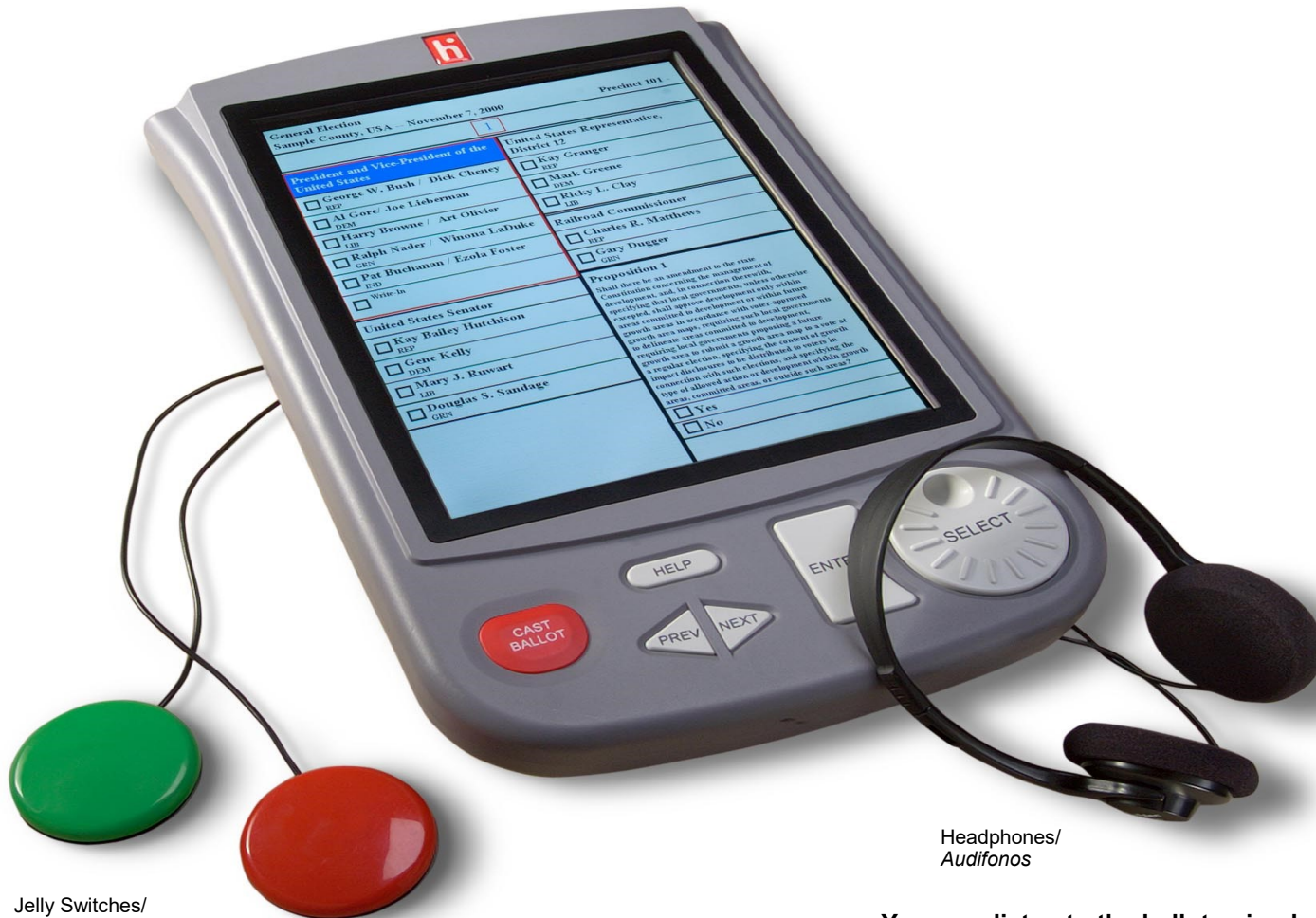
Jelly Switches/ Interruptores de Jalea

You may use jelly switches or your sip n' puff to vote if you cannot operate the wheel & buttons.