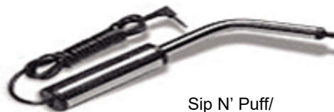
Sip N' Puff/ Chupisople

Puede usar los Interruptores de Jalea o su Chupisople para votar si no puede operar la rueda y los botones.